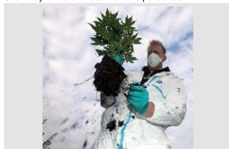
Drugs raid, Pembroke Road, Spencer.

Click Play to watch video from the police raid